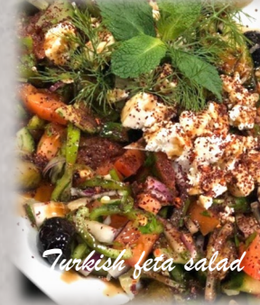
Turkish feta salad